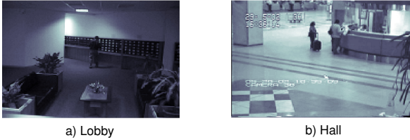
Fig. 2: Two video sequences used in this paper.

the forgetting factor \lambda at 0.97 for all simulations. The tracking ability of OPIT was compared to the state-of-the-art algorithms including \ell_1 -PAST [18], SS-FAPI [17], SSPCA [21], and AdaOja [29]. Their parameters were kept default to have a fair comparison.