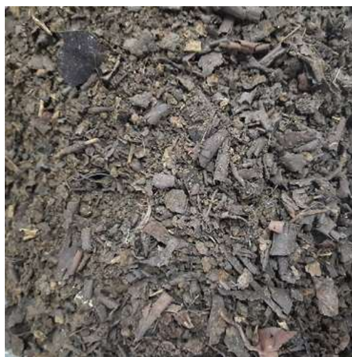
Figure 1. Cassava waste collected from Yen Binh Cassava Factory, Yen Bai province, Vietnam

The cassava residue including cassava peel, cassava pieces and soil discharged during the process of producing starch in Yen Binh Cassava Factory, Yen Bai province (figure 1). The mixture of cassava waste was crushed with humidity of 40-50%. Samples were analyzed for determining composition of some organic compounds and microorganisms.