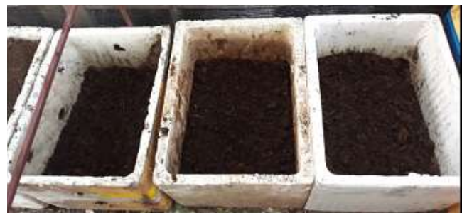
Figure 2. The organic cassava humus in experiments

humic acid 0.7% and fulvic acid 0.5%). Although the contents of total nitrogen, total phosphorus and fulvic acid of experiment 3 was lower than regulations for organic fertilizer according to Vietnamese standard, the humus of experiment 3 can be used for researching and development of organic fertilizers or microbial organic fertilizers. The content of humic and fulvic acids are important indicators to evaluate humus quality. Furthermore, these acids play a very important role in the soil. They help maintaining soil fertility, improving soil moisture, increasing nutrient and water retention in soil. They are nutrient source for beneficial microorganisms in the soil, reducing salinity. For plants, these acids increase the plant's ability of absorbing nutrients in the soil, increase germination, and improve health of root system (Jacoby R. et al., 2017). The quality of the cassava humus in this study showed that the cassava waste can be used as food to raise earthworm for treating cassava waste.